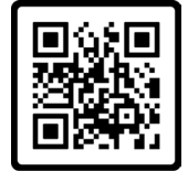
How to Make & Keep Godly Friends