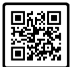
To Know & Be Known

To Know and Be Known 6-day plan https://www.bible.com/reading-plans/15491-to-know-and-be-known