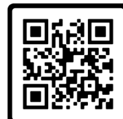
Jesus, I Surrender

Jesus, I surrender 4-day plan https://www.bible.com/reading-plans/36849-jesus-i-surrender-all