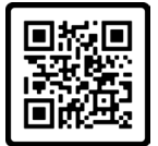
The Idol of Approval

The Idol of Approval 4-day plan https://www.bible.com/reading-plans/26311-the-idol-of-approval